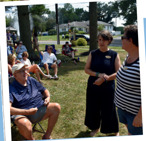
Senior Appreciation Day