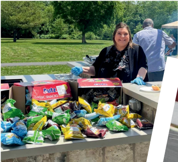
Family Fun Day

Featured below are some of the photos taken at various special events held in Mount Holly Township this summer!