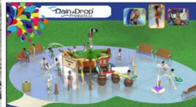
PROPOSED SPLASH PARK