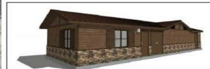
PROPOSED COMFORT BUILDING